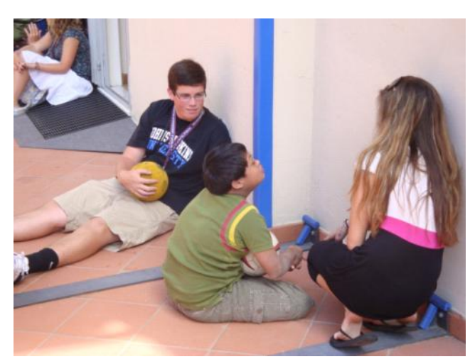
Playing ball with Romeo.