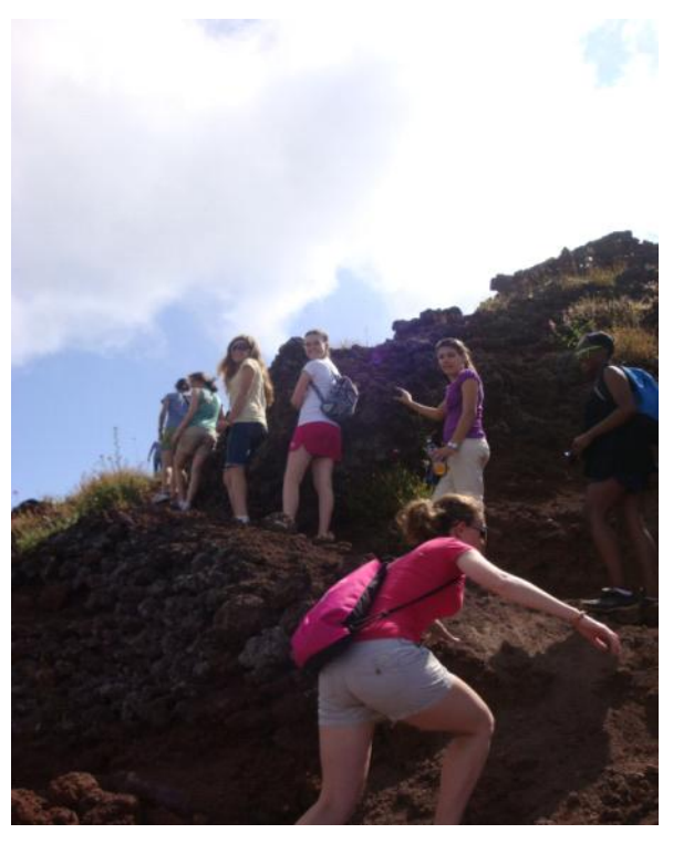
Looking at the crater from the rim!