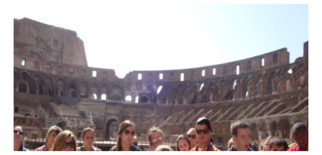
Greece 7-12 Page 1