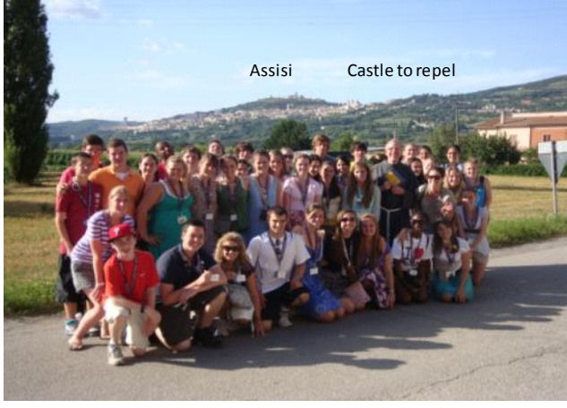
The castle from which we all repelled!